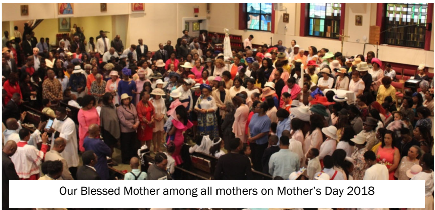
Our Blessed Mother among all mothers on Mother's Day 2018

As the Mother of God, the Virgin Mary has a unique position among the saints, indeed, among all creatures. She is exalted, yet still one of us.