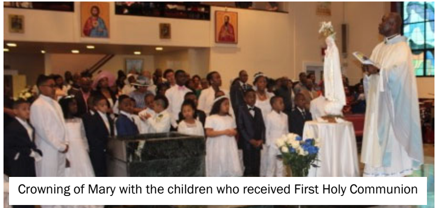
Crowning of Mary with the children who received First Holy Communion