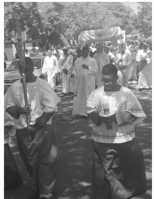
The annual Corpus Christi procession in our parish.

Children who received their First Holy Communion last May 11, 2019 are requested to wear their First Communion attire on June 23rd during the 11:00am Mass and the Corpus Christi procession. Other children are encouraged to wear white dress or suit and join the procession with the First Communicants.